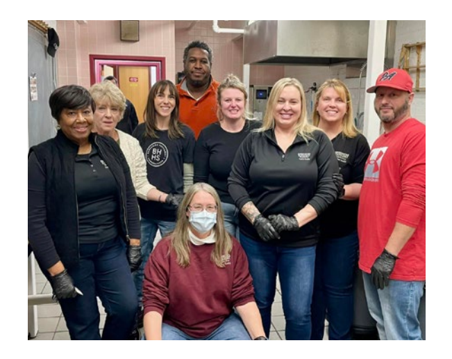
Berkshire Hathaway Home Services - PenFed Realty

Your support helps the City of Frederick DHHS provide hot meals to local residents in need.